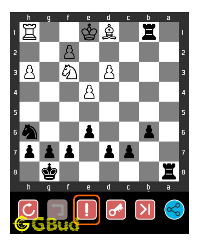
Figure 1.4: Click the help button to get help on next move @ https://gbud.in/gzpnsh2