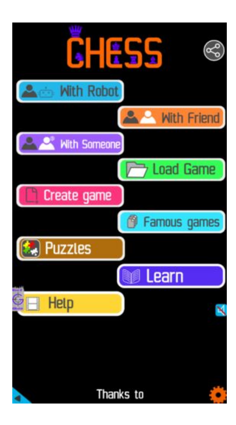
Figure 1.7: Play chess online for free. Solve puzzles and play with friends

Play chess for free at https://gbud.in/chs