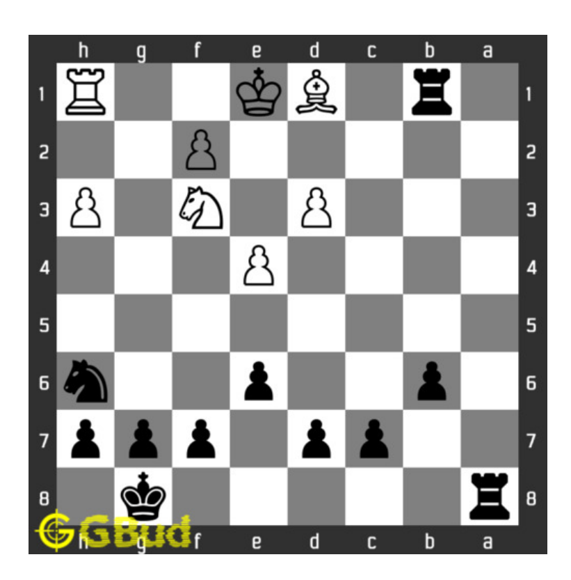
Figure 1.1: Solve this Medium chess puzzle 0013. Gain rook @ https://gbud.in/gzpnsh2